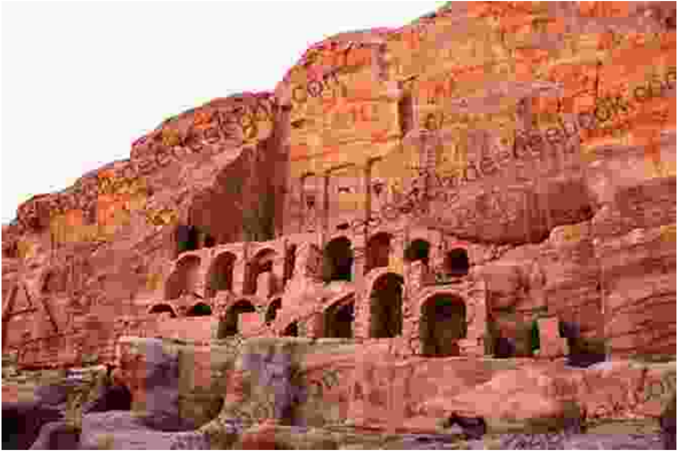
The lost city of Petra, an ancient site in Jordan