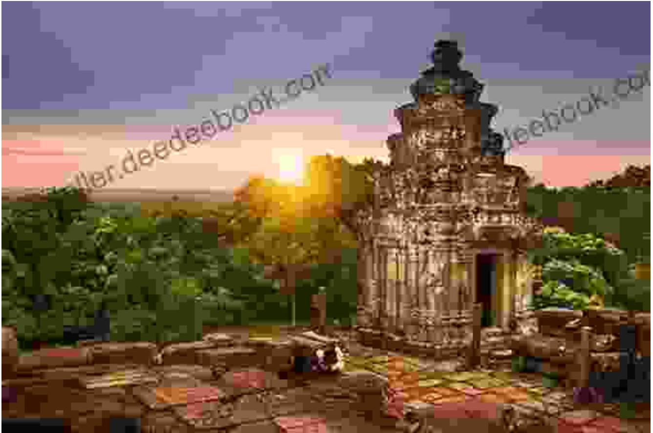
Angkor Wat, an ancient temple complex in Cambodia