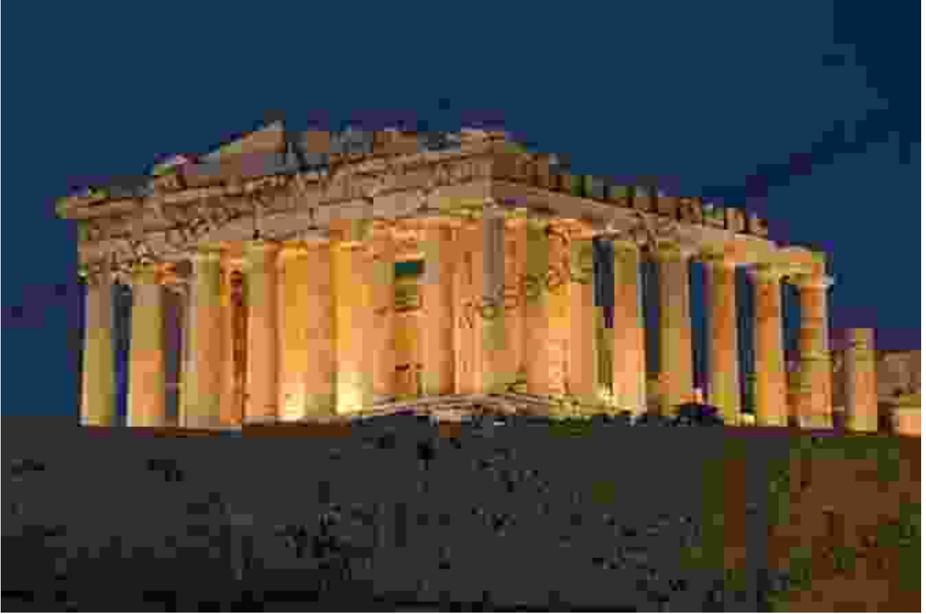
The Parthenon, an ancient Greek temple in Athens