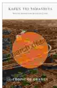
Image alt text: A mosaic of colorful tiles, representing the fragmented and interconnected narrative structure of Tropic of Orange.